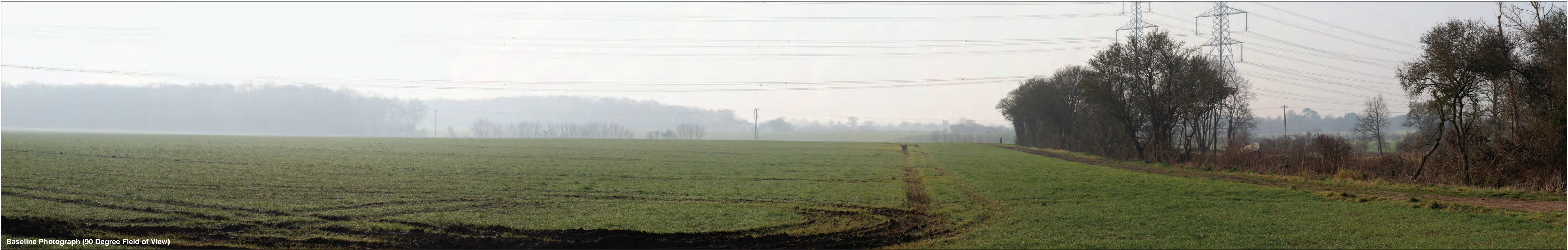
Baseline Photograph (90 Degree Field of View)