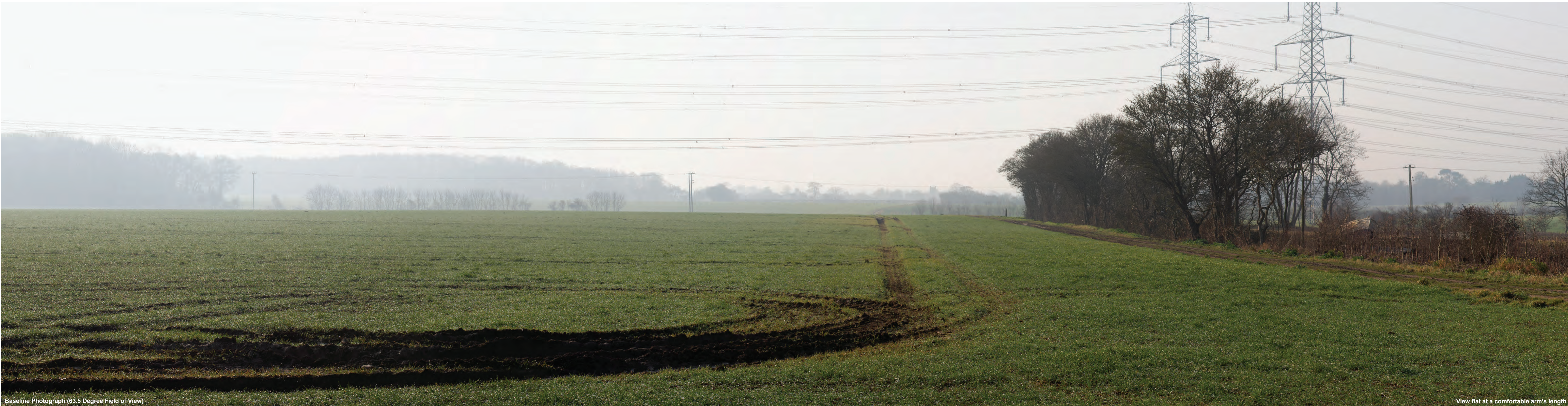
Baseline Photograph (63.5 Degree Field of View)