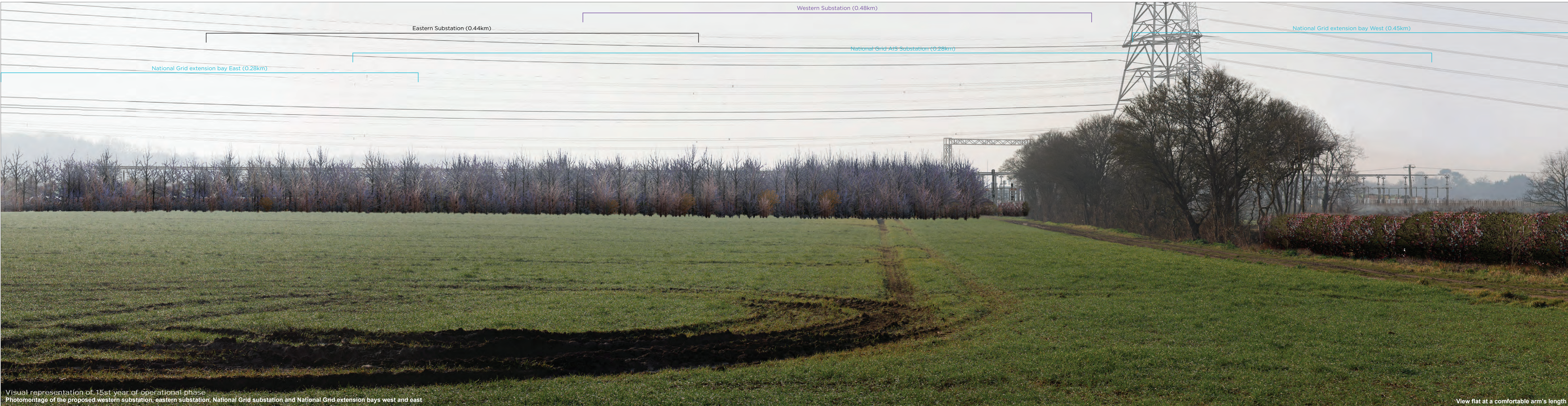
Visual representation of 15st year of operational phase Photomontage of the proposed western substation, eastern substation, National Grid substation and National Grid extension bays west and east