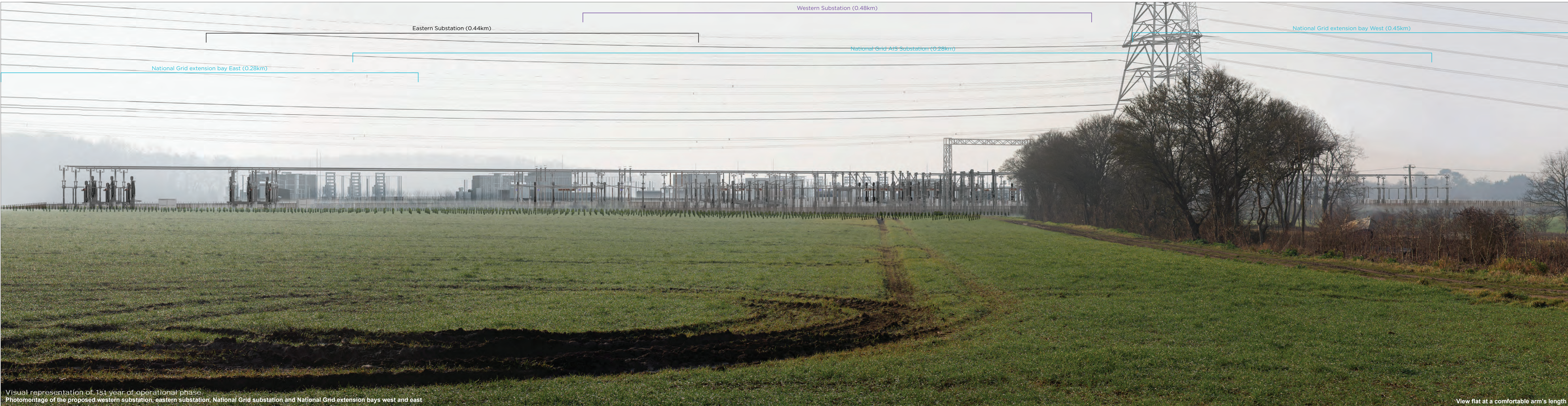
Visual representation of 1st year of operational phase. Photomontage of the proposed western substation, eastern substation, National Grid substation and National Grid extension bays west and east